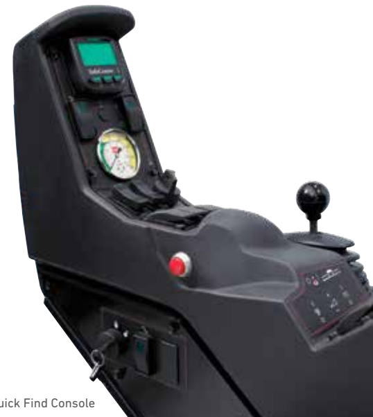
Quick Find Console

The Toro Multi Pro 1750 is ready to perform when you need it most. Invite your Toro Distributor to demonstrate how this sprayer can enhance your spraying programme.