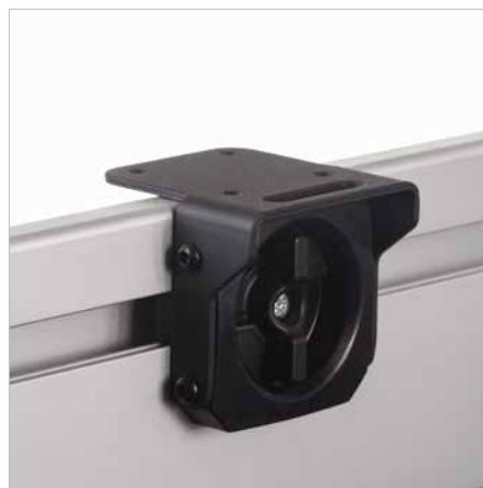
UMAX FusionFit™ Bed Attachment Kit

Our FusionFit™ Bed Attachment Kit will help keep your rakes, shovels, guns, bows and other long-handled tools always at-the-ready. Yamaha's FusionFit accessory system provides a tool-less design that allows you to "click and go" with only a quarter turn. An integrated padlock slot gives you the option to easily secure your cargo and go. Fits 2019-2020 UMAX One/Two, UMAX One/Two Rally, UMAX Range Picker, and UMAX One/Two with Hard Cab models. Sold in pairs.