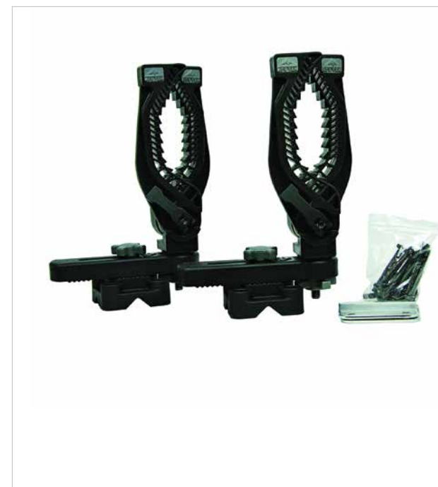
ATV TEK Elite Cam Lock Grip

The ATV TEK V-GRIP offers the most versatility in one multi-use V-Grip. A truly custom fit for your handled tools, soft gun case, bow, ice auger or any other item. Highly adjustable to ensure a perfect, secure fit. Largest size range accommodates more items with infinite locking positions. Quickly and easily access your gear with the tool-free, ratcheting design. Flip cam lock ensures your gear won't fall out while you're hard at work.