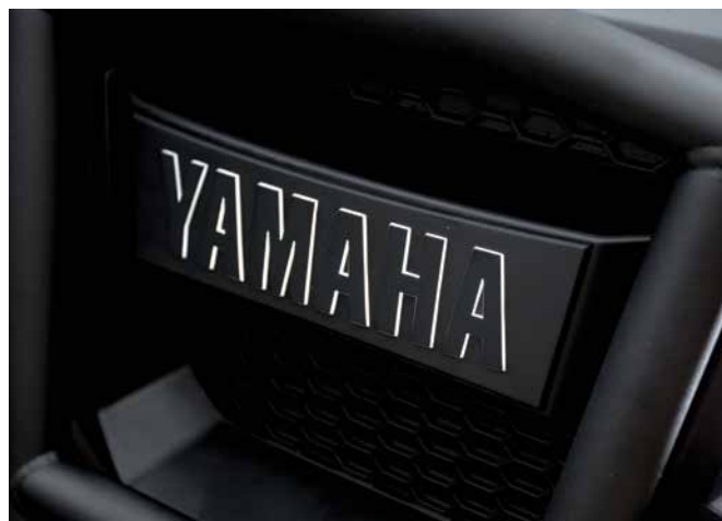
UMAX Yamaha Backlit Logo

NOTE: Accessory Mount Clamps (2HC-F34A0-V0-00) required for installation on Support Sunroof Top or Front Brush Guards, all sold separately.