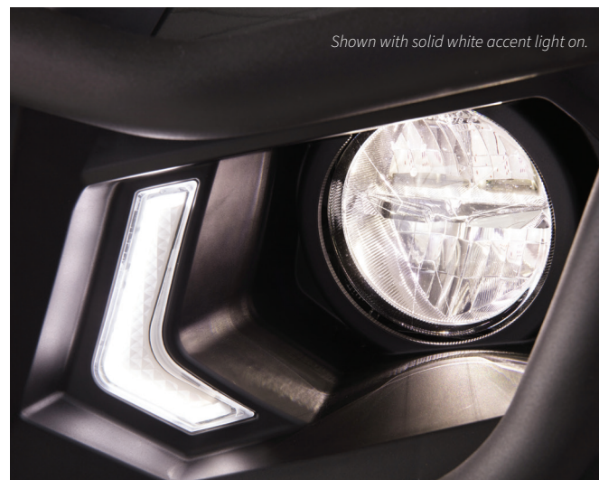
Shown with solid white accent light on.