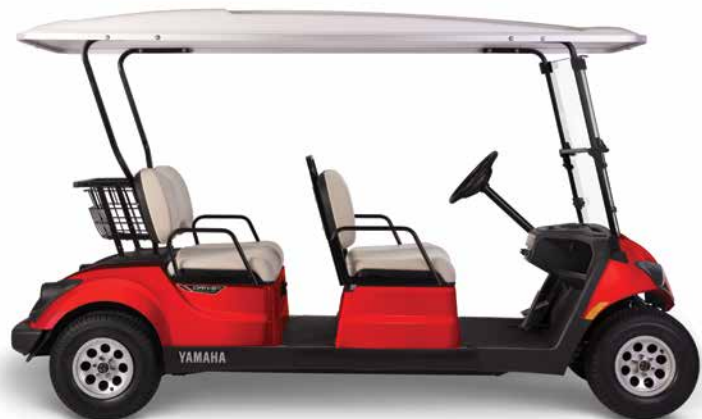
CORAL RED Metallic