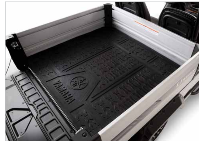
UMAX Cargo Bed Mat

Keep your cargo bed in "fresh out of the box" condition with our wear-resistant, durable Cargo Bed Mat. Made from a proprietary 10mm-thick, reinforced, engineered rubber that slows bed wear as it reduces noise and resonance when transporting cargo. Also, the mat's rough-and-tough styling perfectly matches your UMAX vehicle's look while the aggressive lug pattern helps prevent cargo from sliding. Fits 2019-2023 UMAX Rally One EFI and UMAX Rally Two EFI/AC models.