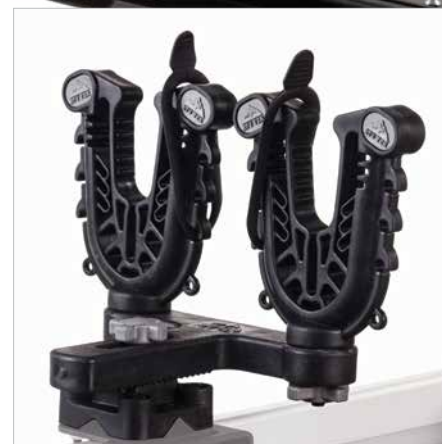
ATV TEK FLEXGRIP™ PRO

NOTE: Requires a UMAX FusionFit Bed Attachment Kit.