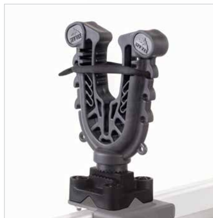
ATV TEK V-GRIP™

NOTE: Requires use of the separately sold ATV TEK V-GRIP™ or ATV TEK FLEXGRIP™ or ATV TEK Elite Series Cam Lock Grip. (Both are available in singles and doubles). Visit ShopYamaha.com to see all options and pricing.