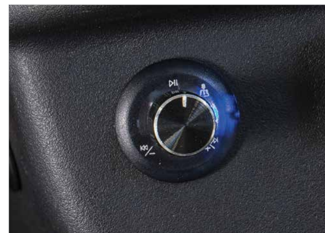
Bluetooth® Audio Controller

Make your sound system just as easy to control in your Yamaha as it is in your family car with our Bluetooth® Audio Controller that allows you to change songs, adjust volume and pause/play. Pairs perfectly with the MA100 Speaker/Amp Package (GCA-MA100-00-00)—sold separately. Universal fit for most golf cars.