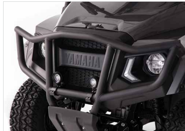
UMAX Front Brush Guards

NOTE: Fits UMAX Two models as is. Cutting of mat required to fit UMAX One EFI models.