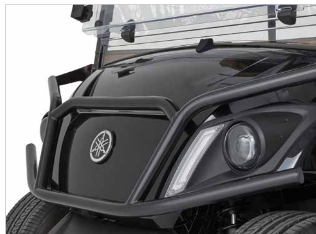
Drive 2 Front Brush Guard

Protect the front end and headlights while adding a little rugged flair with this front brush guard that's designed to seamlessly integrate with the front profile all while creating a tough, aggressive look. Fits 2017-2023 Drive 2 Concierge 4/6 and Drive 2 Super Hauler models.