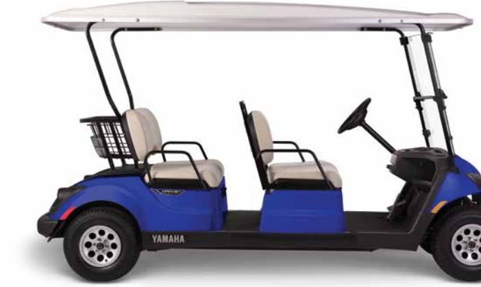
ARCTIC DRIFT Matte