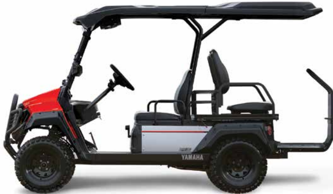
CORAL RED Metallic