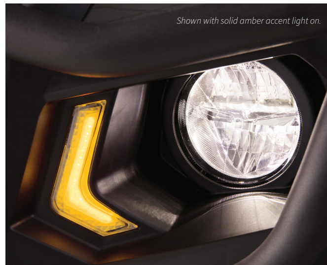
Shown with solid amber accent light on.