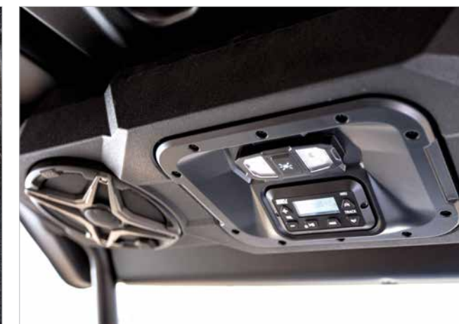
Overhead AM/FM Bluetooth® Audio System

Instead of playing music through your cellphone speakers, enjoy your favorite tunes through our Overhead AM/FM Stereo with Bluetooth® that can withstand the harshest conditions, takes up none of your car space, and gives you impeccable sound quality. This system is fully weatherproof and features 6.5" speakers, six preset equalizer options, Bluetooth®, AM/FM tuner with LCD backlit display and internally integrated antenna, integrated hyper-white, six LED dome light. Includes wiring, mounting hardware, and step-by-step instructions (simple 2-wire installation). Fits The Drive and Drive 2 commercial cars and all 2019-2023 UMAX utility vehicles with factory Sun Top.