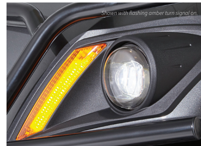
Shown with flashing amber turn signal on.