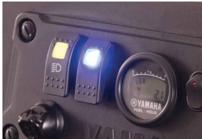
UMAX Headlight High/Low Switch

Add the option to switch between high- or low-beam front LED headlight with our Headlight High/Low Switch. With easy plug-and-play installation in the front dash panel, it will seamlessly match the factory headlight on/off switch. Fits 2019-2023 UMAX Rally models.