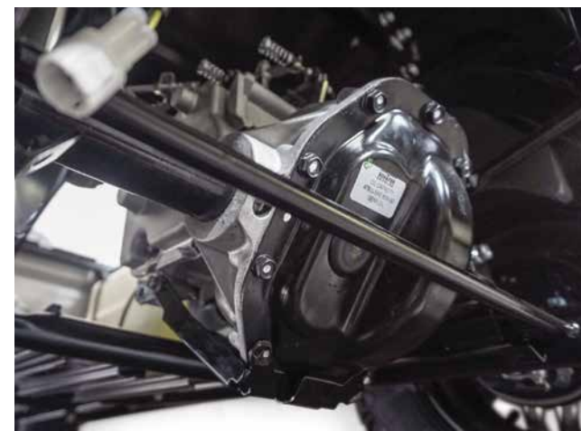
UMAX Rear Arm Skid Plate

NOTE: Will not work with Range Picker Mount.