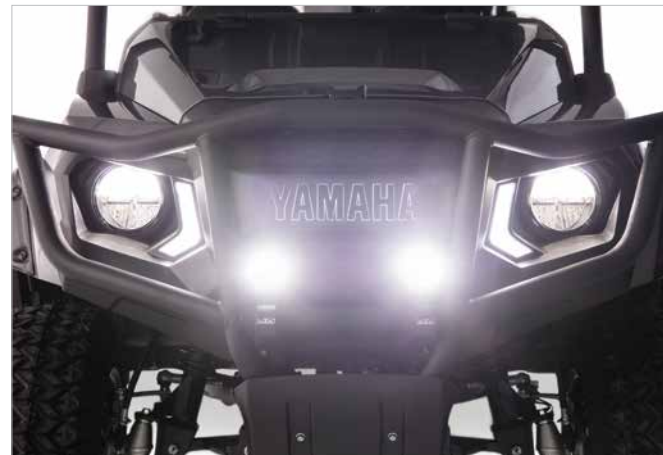
Bullet Accessory Lights

NOTE: Will not work with Premium or Ultra-Premium Light Upgrade Kits.