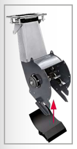
Load accelerator Load accelerator case is equipped with wear and tear sheet metal parts which are screwed and are therefore easily changeable.