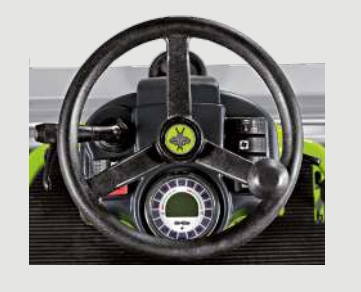
An electronic control unit and several sensors guarantee the safety of the machine.