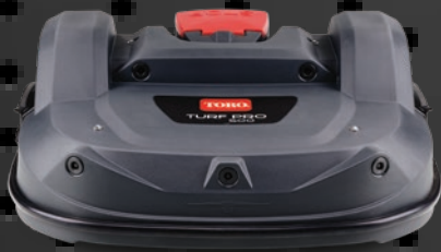
Turf Pro 500