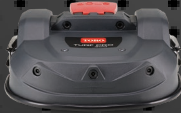
Turf Pro 300