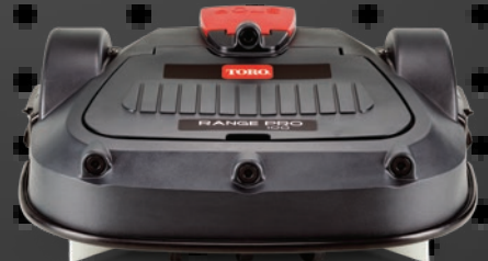
Range Pro 100