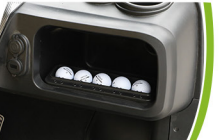
Storage compartment with golf ball & tee holder