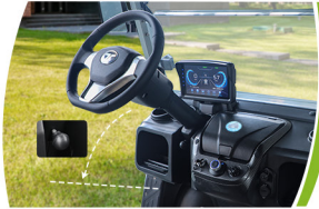
Adjustable steering column