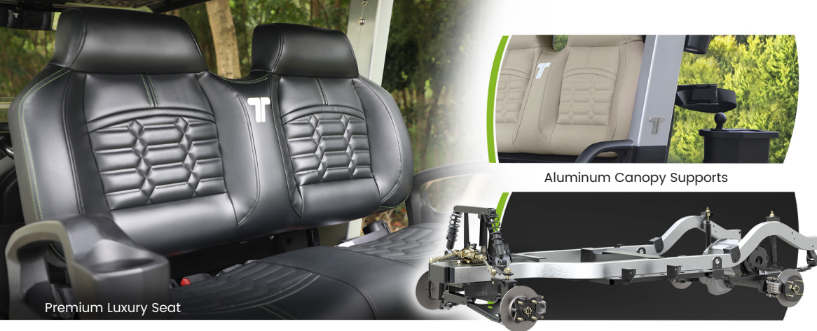
Premium Luxury Seat