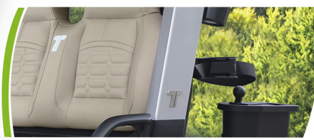
Aluminum Canopy Supports