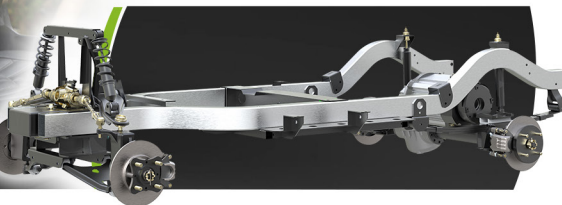
Aluminum Chassis & Hydraulic Brakes