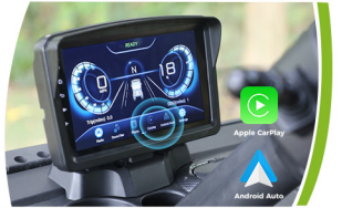
9" Touchscreen with carplay compatibility