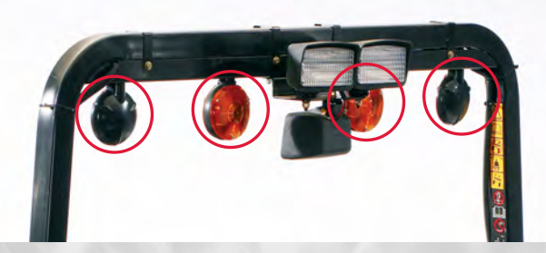
ROPS SIGNAL LIGHT KIT

Consists of four vertical posts connected together by top members to protect operator from injury in case of roll over.