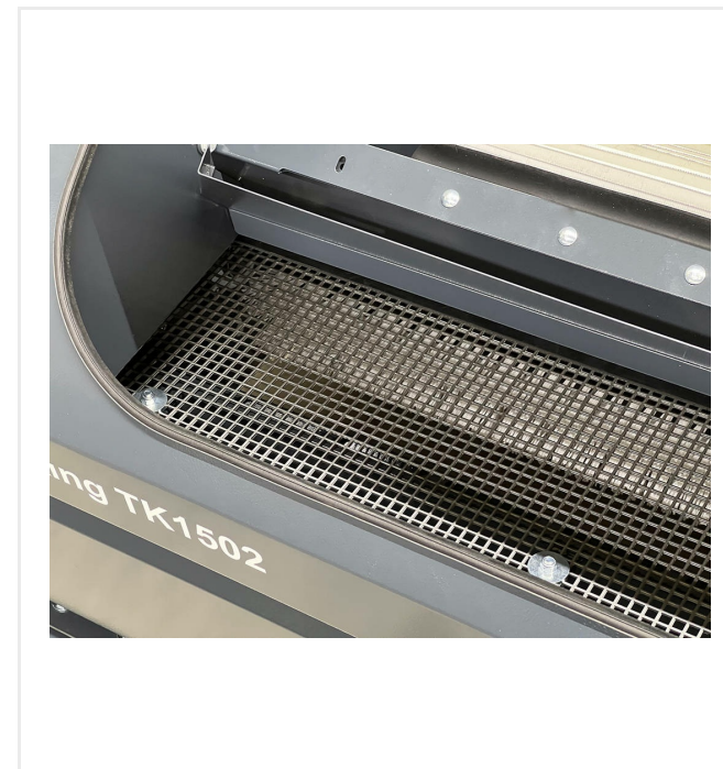
4 - 10 mm

Handwheel for comfortable adjustment and scale to control the working depth.