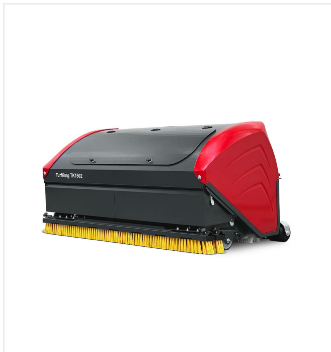
TurfKing TK1100 / TK1502